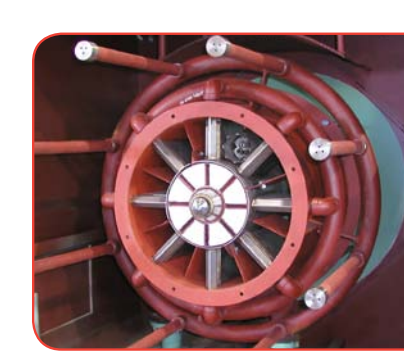
Delta-NOx™ ULN Burner

Coen's ultra-low-NOx burners are engineered to help you meet the most stringent emissions requirements by achieving ultra-low emission levels and delivering dependable performance year after year.