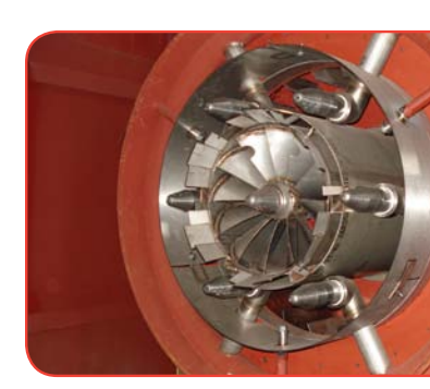
DAFTM ULN Burner